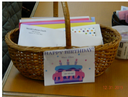
A basket full of cards from the members of Messiah.